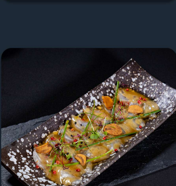
Seabass Carpaccio AED 70