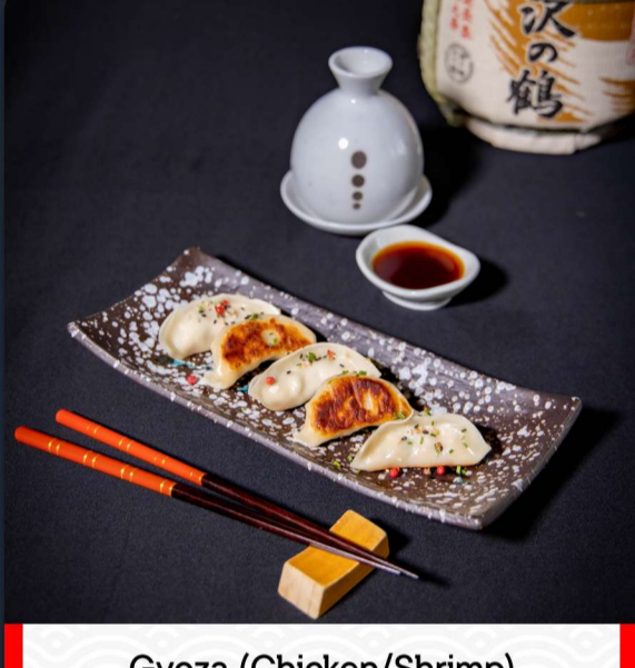
Gyoza (Chicken/Shrimp) AED 60/67