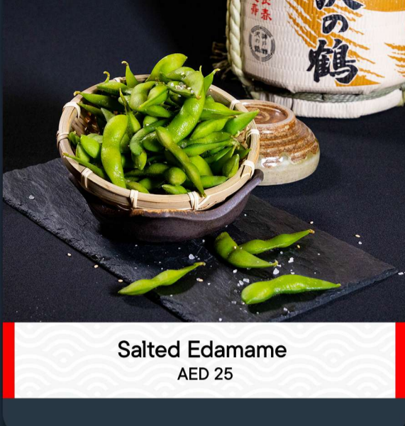
Salted Edamame AED 25