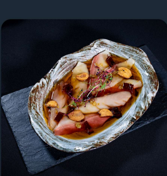
Yellowtail Carpaccio AED 70