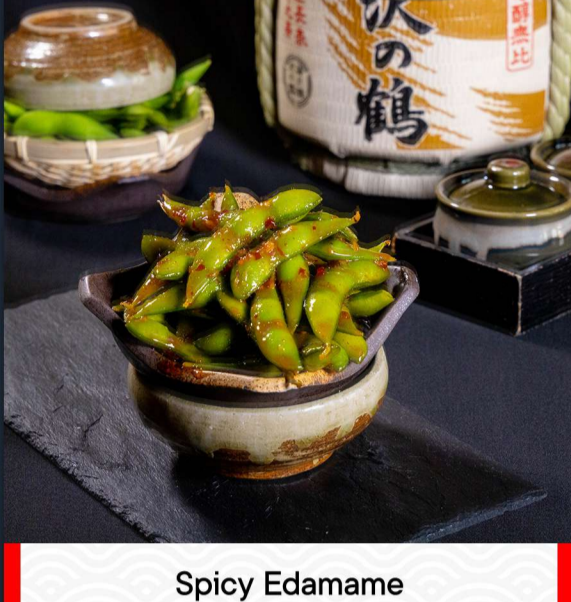
Spicy Edamame AED 30